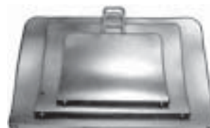
C301 / 2